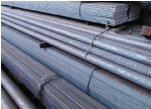
Rolled products: steel rods and plates