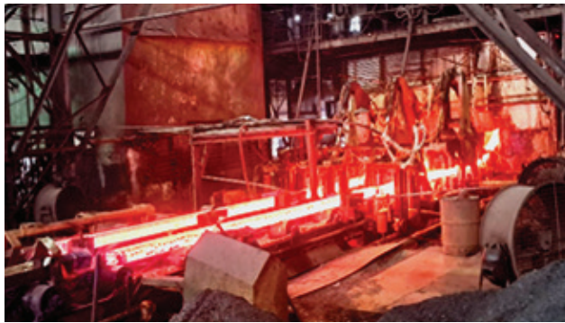
Continuous casting process