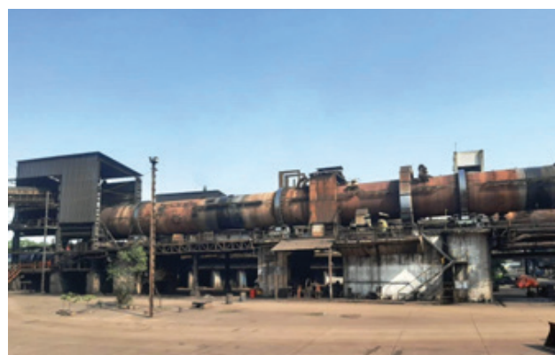
Rotary kiln, DRI industry