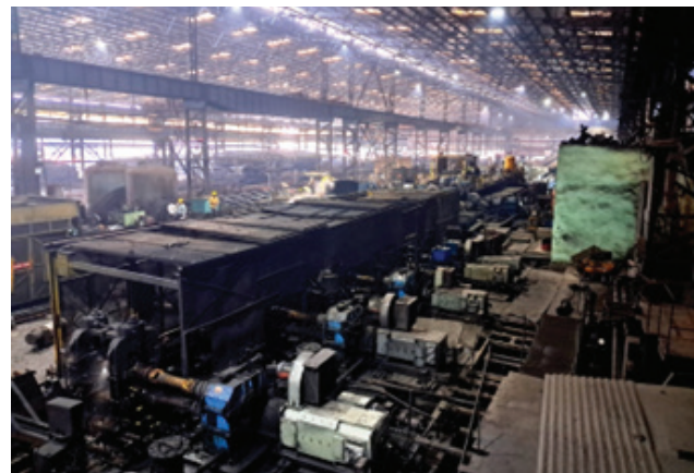
Shop floor; steel re-rolling mill (SRRM)