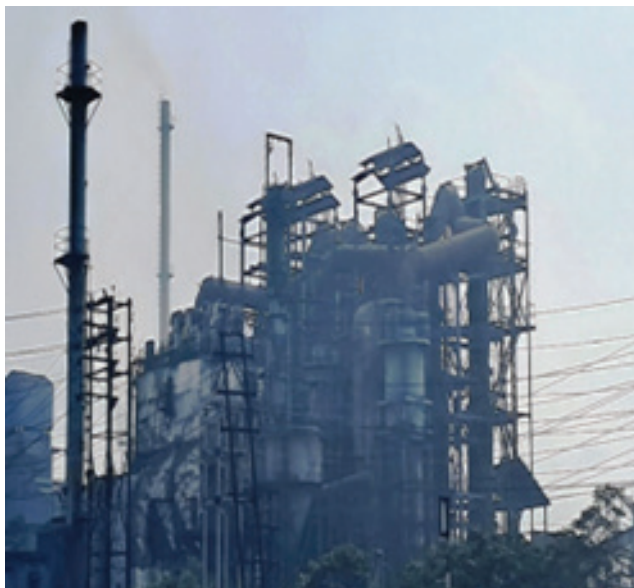
Ferro alloy industry